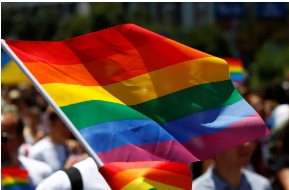
The rainbow flag, commonly known as the gay pride flag or LGBT pride flag, is seen during the first Gay Pride parade in Skopje, North Macedonia June 29, 2019