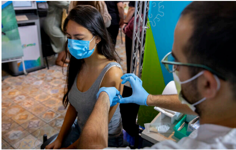
Israelis receive their third dose of the COVID-19 vaccine at a Clalit clinic, on September 1, 2021, in Jerusalem.

The Health Ministry last week also announced that the “Green Pass” system — a document that allows entry into certain gatherings and public places for those who are vaccinated or have recovered from the coronavirus — will expire six months after the holder received their second or third dose, hinting that a fourth dose may be administered in six-months time.