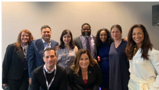
1:52 PM · Sep 26, 2019 · Twitter Web App