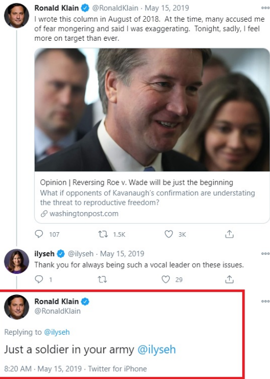
Biden Chief of Staff Ron Klain a soldier in NARAL army

NARAL has openly praised Planned Parenthood’s white supremacist founder Margaret Sanger, and like Planned Parenthood, was founded by proponents of eugenics. As Live Action News previously reported, two of NARAL’s three member pre-formation planning committee were men who held and promoted radical racist, eugenicist ideas about population control. In addition, employees of color within NARAL have publicly accused the organization of racism (as have employees of Planned Parenthood ). Despite this history, Klain called both NARAL and Planned Parenthood “heroes” on Twitter in 2019: