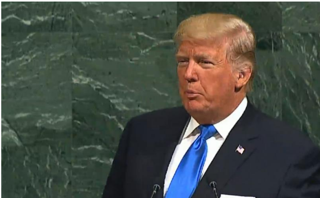
President Trump delivers an address to the United Nations.